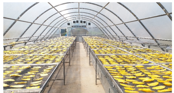
Mangos were dried in the dryer