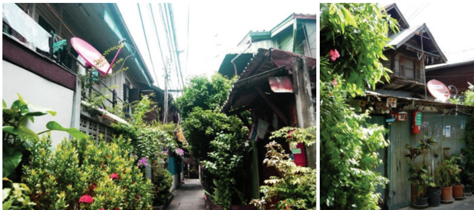
Figure 1: Top: Map of Khianniwat- Kai Chae Community, one of long-established urban communities that has persisted until today. Below: Photographs of traditional houses located on a small lane inside the community (Issarathumnoon, 2016).