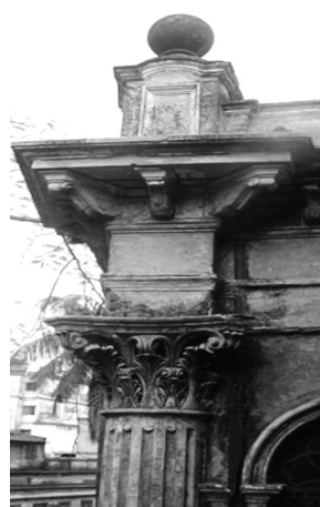
Figure 20: Decorative column, Shahid Samsul Alam Boy's hostel, Dhaka