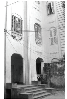
Figure 9: Out house block of Rebutimohan House, Dhaka