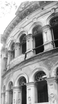
Figure 30: Front Rebutimohan View of Shahid Samsul Alam Boy's Hostel