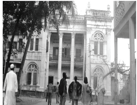
Figure 32: Front view of Rebutimohan house