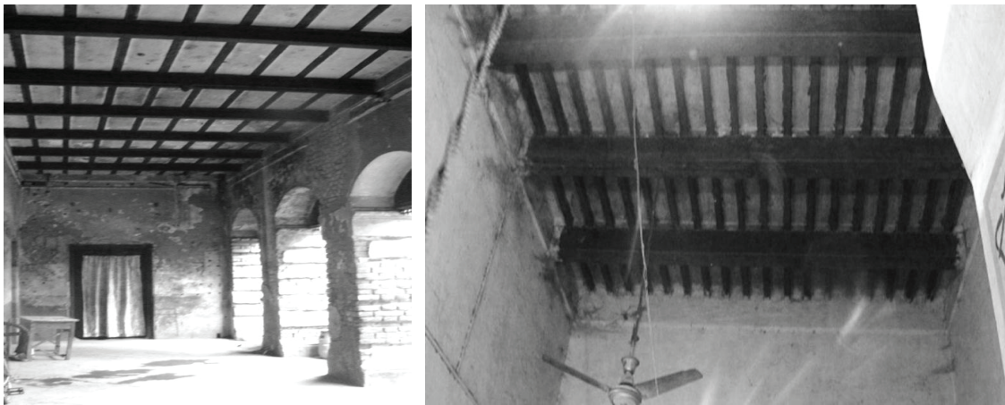
Figure 22: Steel rafter & flat bar purlin, in both Rebutimohan house (left) and Shahid Samsul Alam Boy's hostel (right), Dhaka

Pediments of Greek, Roman and Renaissance architecture are incorporated into these examples of Zamindar houses. The pediments are usually placed