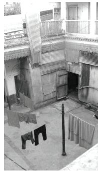
Figure 6: Court of Rebutimohan House, Dhaka