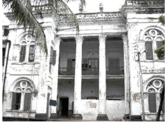
Figure 3: Rebutimohan House, Dhaka