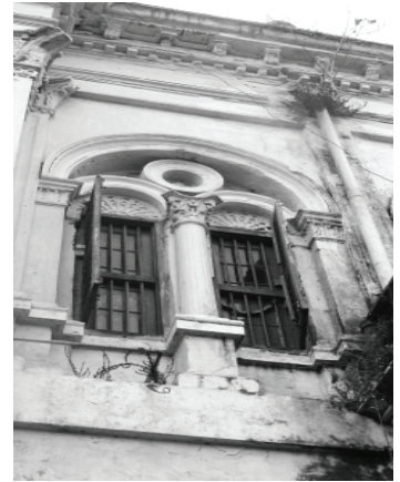
Figure 17: Venetian arch with iron frame, Rebutimohan House, Dhaka

lime plaster both inside and outside. A definite type of common and English bonds was developed and practiced in the walls (Figure 15). Different types of arches have been used in these Zamindar house. The round arch, semi-circular arch (Figure 16), segmented arch, trefoil arch, multi foil arch, Venetian arch (Figure 17), and flat arch etc. are found in the study area. The arcade supported either by brick