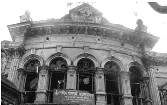
Figure 25: Occidental ornamented Pediment

The kachari or baithak khana or the outer house are always kept separated both physically and conceptually from the andor (inner house). The functional and symbolic value of the activities, use