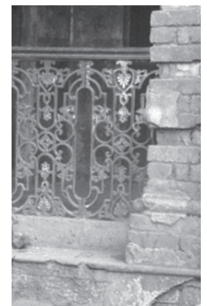
Figure 27: Ornamented