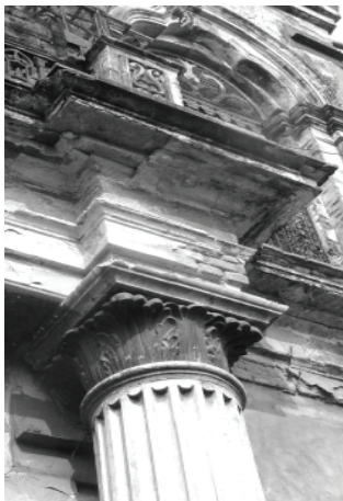
Figure 18: Corinthian Column, Ruplal house, Dhaka

During the colonial period columns added a new dimension to Zamindar houses. Doric, ionic,