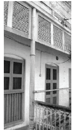
Figure 21: Wooden column, Rebutimohan House, Dhaka