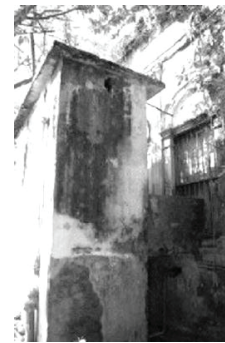
Figure 8: Adjacent lavatory, Rebutimohan House, Dhaka