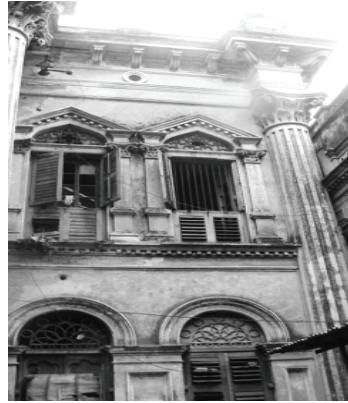
Figure 23: Palladian window with pediment, Shahid Samsul Alam Boy's hostel