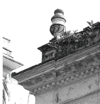
Figure 26: Projection at crown