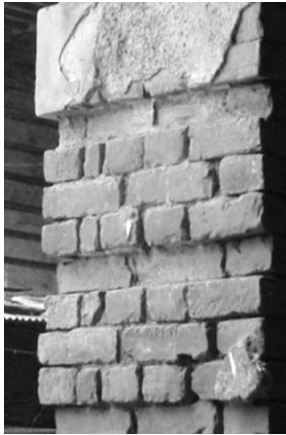
Figure 15: Brick wall, Ruplal house, Dhaka