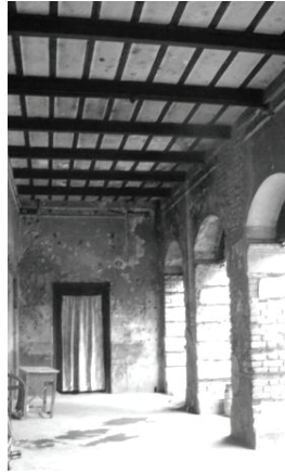
Figure 13: Corridor at Ruplal House, Dhaka