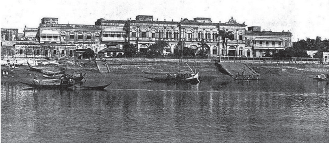
Figure 29: The oldest part of Ruplal House, was built by an Armenian Zamindar, Aratun, in the 1700s

The fortified, secured and apparently solid houses were built by the Zamindars in the early phase (Figure 29). But during the colonial period the Zamindars were highly influenced with the bungalows of the British and its occidental elements which were boldly present in the houses studied. The blending of introvert and extrovert characters, lavish use of colonial elements, and grandeur scale all dominated the planning and imaging the house (Figure 30, 31, 32) during the second phase of development.