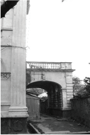
Figure 12: Portico of Rebutimohan House, Dhaka