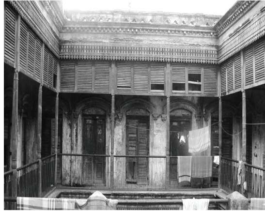
Figure 14: Rooms at Shahid Samsul Alam Boy's hostel, Dhaka

and are usually colonnaded or an arcade. The Rebutimohan house has several terraces connected with each other at different levels. The corridor provides a sense of privacy in Zamindar houses, and are used for circulation in both lower and upper story. Stair cases are one of the indispensable parts of multistoried Zamindar houses. It is found from the survey that all these courtyard type houses have adjacent staircases placed near the court for vertical movement. Some of these staircases are made of timber with brick or steel joist supports.