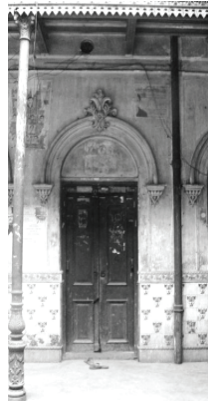
Figure 22: Arch headed door, Rebutimohan house