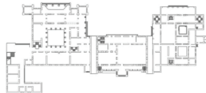
Figure 10: Ground floor plan of Rebutimohan House, Dhaka.