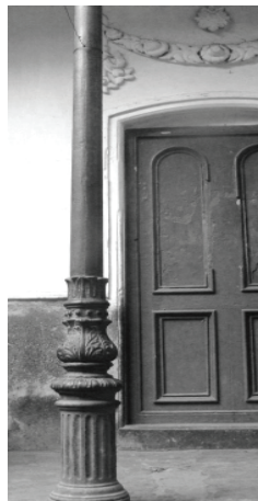
Figure 19: Pre cast steel column, Rebutimohan House