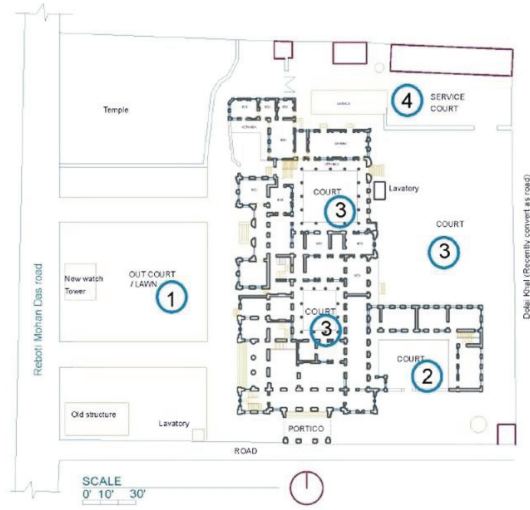
Figure 2: Compound plan of Rebutimohan House, Dhaka