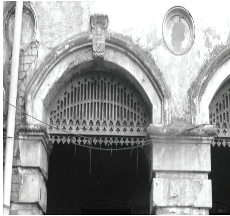
Figure 16: Semi-circular arch with iron frame, Ruplal house, Dhaka