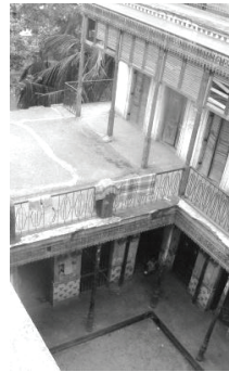
Figure 7: Court of Shahid Samsul Alam Boy's Hostel, Dhaka