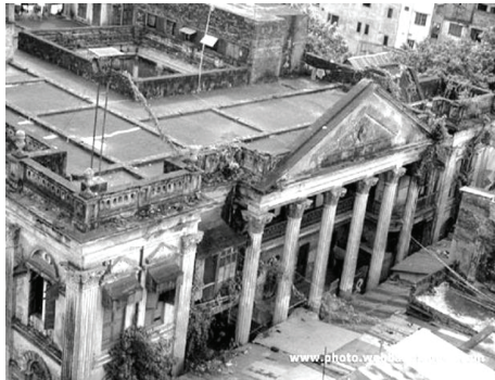
Figure 31: Front view of Ruplal house