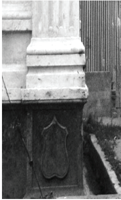
Figure 21: Floral window, Ornamented plinth, Rebutimohan house