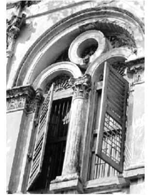
Figure 24: Tracoidal Rebutimohan house

on the portico and parapet level (Figure 25). Both the triangular and round pediments are decorated with racking cornice, molding and other decorative bands. This ornamentation is popular in Zamindar houses because this crown like architectural element reflected the royal image of the Zamindar class.