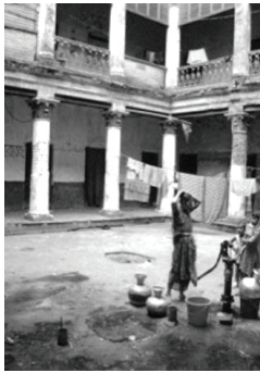
Figure 5: Court of Ruplal House, Dhaka