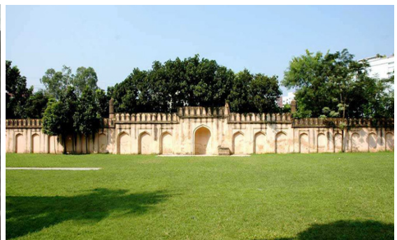
Figure 10 & 11: Some images of Mughal Eidgah on Sat Masjid Road