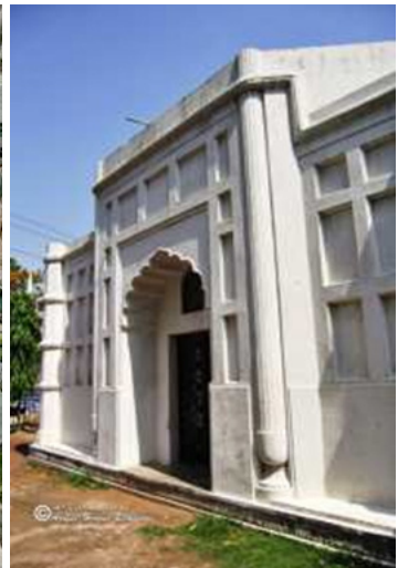
Figure 5: Image of Unknown Tomb (HAQUE, 2009)