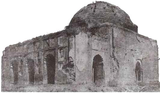
Dacca. Dara Begam's tomb (mid-17th century)