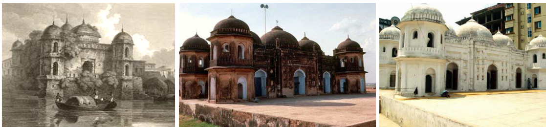
Figure 12, 13 & 14: Different phases of Sat Gambuj Mosque

Dr Ataur Rahman, current regional director of the department of archaeology, said the plan to change color was “ill-conceived” and “wrongheaded.” Apart from the color, the management committee of the mosque incorporated several changes in its design, including constructing a washroom with tiled floor, side walls and modern toilet facilities. According to Ataur such changes may add to a gradual process of distortion of archaeological sites, which require proper awareness of common people and proper renovation by the authorities. Government should be strict about implementing guidelines with regard to renovating a monument. Originality of an archaeological site should not be damaged or altered. The Buriganga River used to flow past the mosque when it was built on a beautifully landscaped land covered with forests. With time, the river changed its course and now flows off one kilometer west of the mosque. Saat Masjid is about 38 feet long and 27 feet wide and the thickness of its walls measures four feet. In recent times, the authorities lengthened the prayer hall by making canopied rooms at the front to meet the increased attendance of those offering prayers. There are three large onion-shaped domes placed over the main prayer hall and four small ones on all four corners of the rooftop hence the name Saat Gombuj Masjid (seven-domed mosque). (Siddique, 2013)