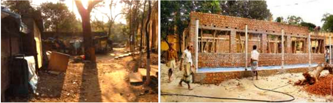
Figure 19 & 20: Arbitrary use of its abandoned land of Dhanmondi Eidgah ground (Collected)

abandoned land is accelerating the process of decay. (Save historic Dhanmondi Eidgah, 2015) (Sun, 2015) (Figure 19 & 20)