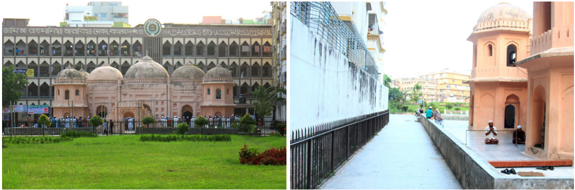
Figure 15 & 16: Insensitive developments surrounded by Sat Gambuj Mosque

Few years ago a multistoried madrasaa building was built without minimum sensitivity to the spiritual as well as historic value of this Mughal structure. The identity and integrity of this historic building is endangered. (Figure 15 & 16)