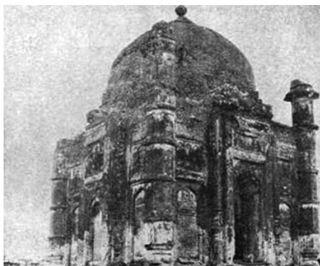
Dacca. Allakuri's Mosque (Cir.1680)

The main attraction is the large dome, 25 feet in diameter, and there is no other example of such a big dome in Dhaka. Primarily, its shape is totally round, as can be seen in photos taken in the 1950s. But changes were made during renovation, possibly in the 1970s. Definitely, the room below was strongly built to bear the weight of such an enormous dome. The transformation from a tomb to mosque was completed in the Pakistan period. Currently it is part of a madrasa (residential institution for Islamic education) complex, and it is hard to accept it as a heritage site. (Dara Begam's Tomb Dhaka)