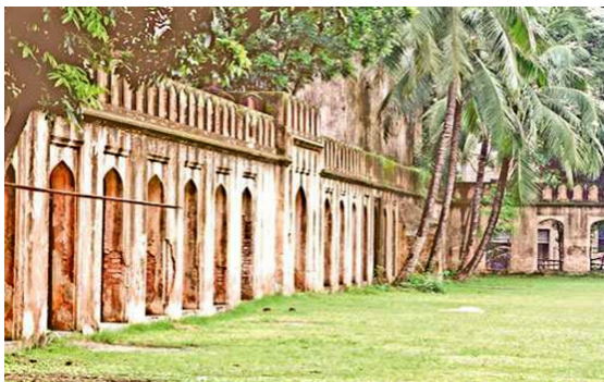
Figure 17 & 18: Insensible growth surrounded by Dhanmondi Eidgah ground (Collected)

The Eidgah was constructed in 1640 by Mir Abul Qasim Dewan who was ordered by Prince Shah Shuja - Mughal governor of the Bengal and the son of Mughal Emperor Shahjahan. A newly constructed building within five feet of the Eidgah has blocked the main entrance. According to an expert's opinion a drilling rig used during the construction of the building is believed to have weakened the Eidgah's foundation due to vibration. Digging a road by WASA (Water and sewerage Authority) and PWD (Public works department) near the wall of the ancient structure is posing a threat to its existence. A library and a mosque built in its premises have spoiled the elegant look of the heritage monument. The wall of the Eidgah has been used as a sidewall for constructing a dormitory for the employees of the Eidgah Mosque. Moreover, random use of its