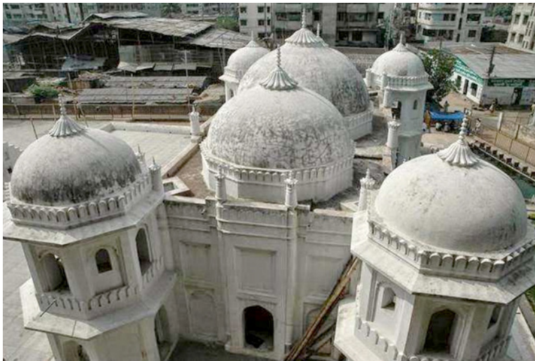
Figure 4: Image of Sat Gambuj Mosque