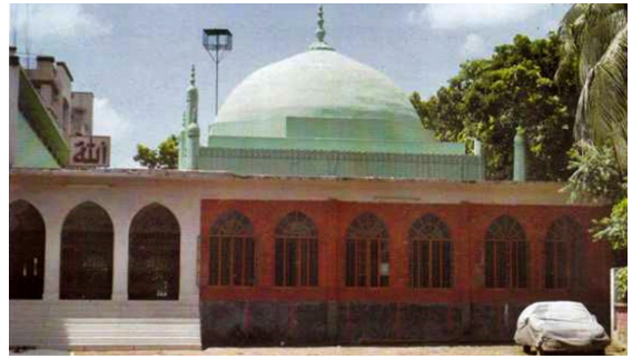
Dara Begam's tomb