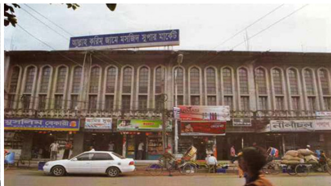
Allakuri's Mosque (turned into a market complex)