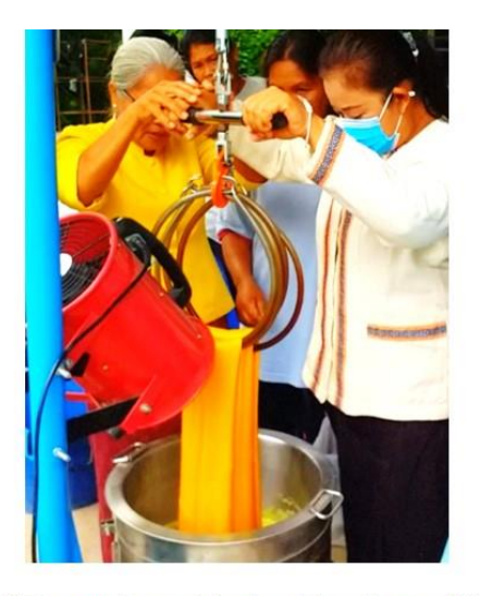
(b) Degumming and dyeing aid equipment (New)