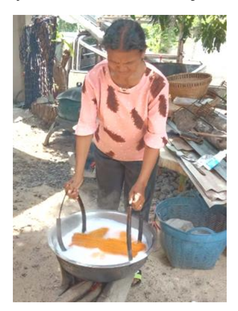
Figure 1 Degumming and dyeing process

The population in this study was 4,180 workers in the degumming and dyeing process as shown in Figure 1. Krejcie and Morgan's table for determining sample size was used to calculate the sampling [16] of 400 workers(female)made with simple random sampling. Draw lots were made to give chance to all samples to get selected fairly. The workers were then informed about the objectives and the process of the research, and the data of anthropometric measurements for standing work [17].