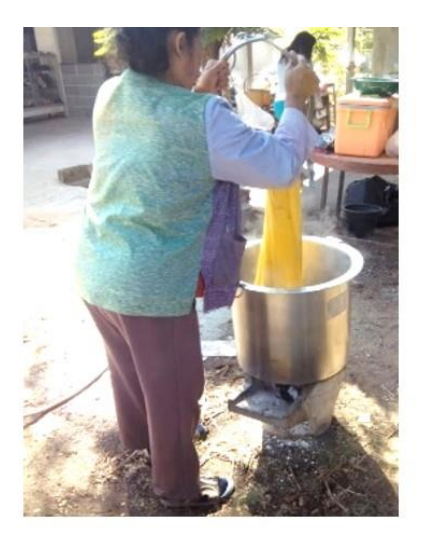
(a) Traditional degumming and dyeing equipment [15]

Figure 3 shows the development of the degumming and dyeing aid equipment. This could change the way of working which helped to reduce the hands' movement upward above shoulders to grab the objects in working, reducing looking up and down, and the workers' backs bending.