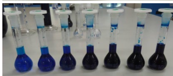
Figure 2 Moh Hom dye appearance.