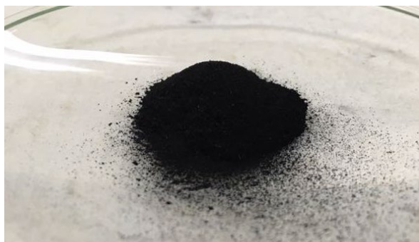
Figure 1 Pineapple leaf activated carbon.

the cross-sectional area of one molecule of methylene blue = 108 \text{ \AA}^2 ; NA is Avogadro's number, 6.02 \times 10^{23} \text{ mol}^{-1} ; and M is the molecular weight of methylene blue, 373.9 \text{ g mol}^{-1} . The characteristics of PAAC are summarized in Table 1.