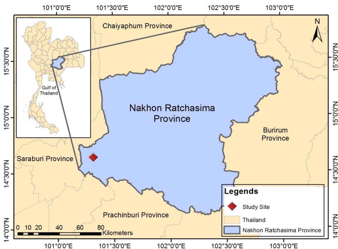
Figure 1 Experimental study site

was collected from the wastewater treatment plant of Phuket Municipality. The samples of MSWIFA and SS were air-dried, ground and sieved through a stainless steel 2-mm sieve and characterized before use as soil amendments. The physicochemical characteristics of the amendments and the soil were determined, including pH (1:1 and 1:2 for soil to water ratio, and amendments to water ratio, respectively) [10], electrical conductivity (EC), organic matter content (%OM) by the Walkley-Black procedure [11], cation exchange capacity (CEC), exchangeable potassium (exc.-K) using 1 N \text{NH}_4\text{OAc} extraction (pH 7), total nitrogen (total-N) by the Kjeldahl procedure, available phosphorus (avail.-P) by Bray II method, soil texture analysis using the pipette method and metal analysis according to the USEPA method 3052 protocol [12].