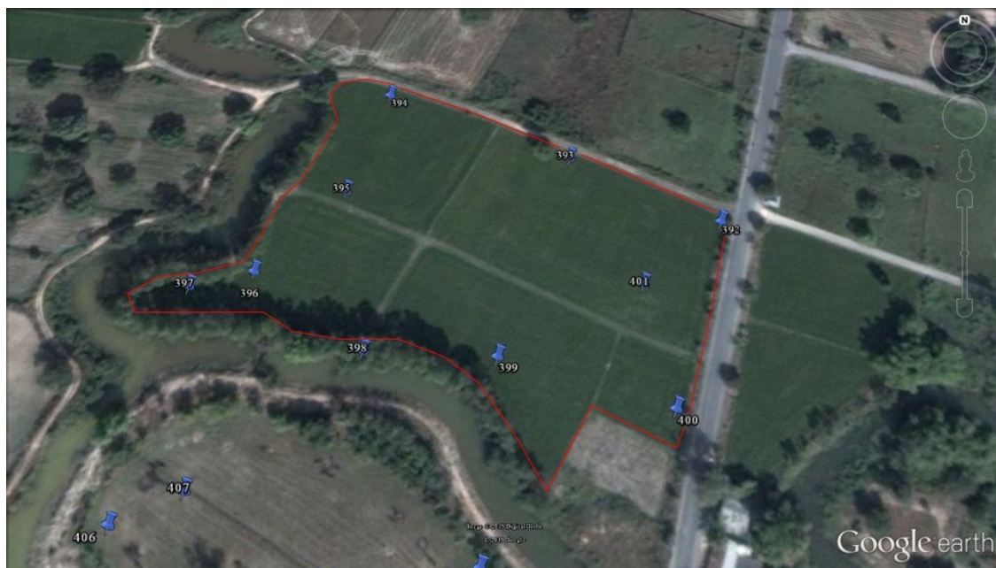
Figure 2 Sampling sites of soil subsamples taken from 10 locations within the sampling area presented with GPS (Global Positioning System) using Google earth program (version 7.1.2.2041)