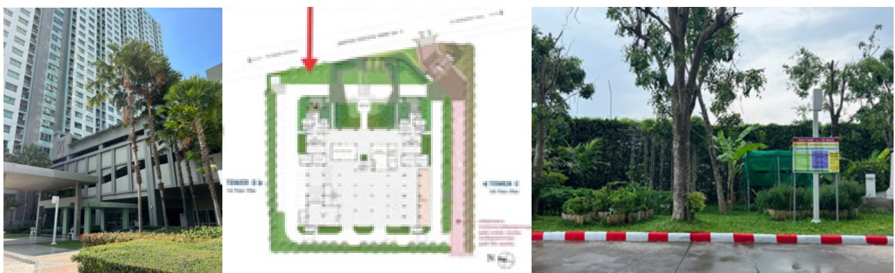
Figure 1. Residential condominium communities and installation points of innovative low-carbon

Volunteer lecturer team. It is a team providing knowledge from educational institutions, various government and private agencies in the form of social networks such as universities, etc., and community members participating in various activities related to innovation. These are the driving forces for collaborative innovation.