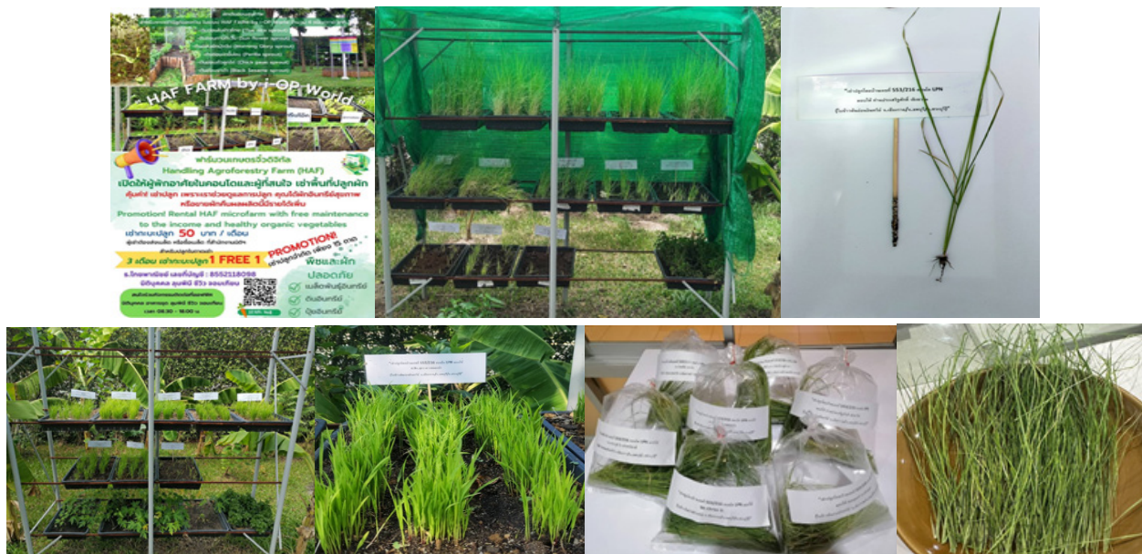
Figure 4. Activities of Zone: HAF Sprouts in the innovative low-carbon agroforestry farm