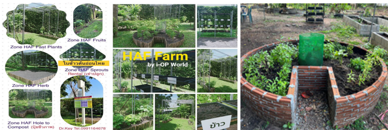
Figure 3. Structure of the planting system in an innovative low-carbon agroforestry farm

(2) Natural Agriculture Learning Center “Organic agroforestry reduces carbon” promotes and disseminates results to communities and interested parties