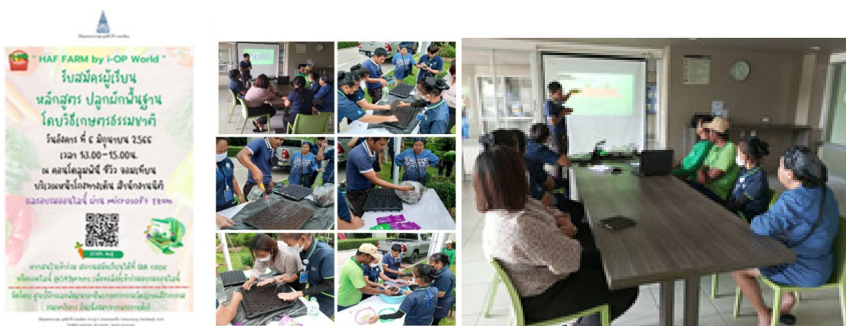
Figure 7. Training for innovative low-carbon agroforestry farm for community members

both in the country and abroad, such as organizing training courses on organic forestry innovations to reduce carbon to improve the quality of life and spirit for free for community members and interested citizens and opening for study tours where the target group consists of community operations officer under the condomini-