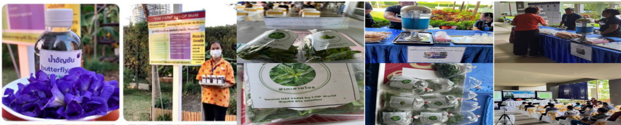
Figure 9. Relationship activities of community participation in the farms