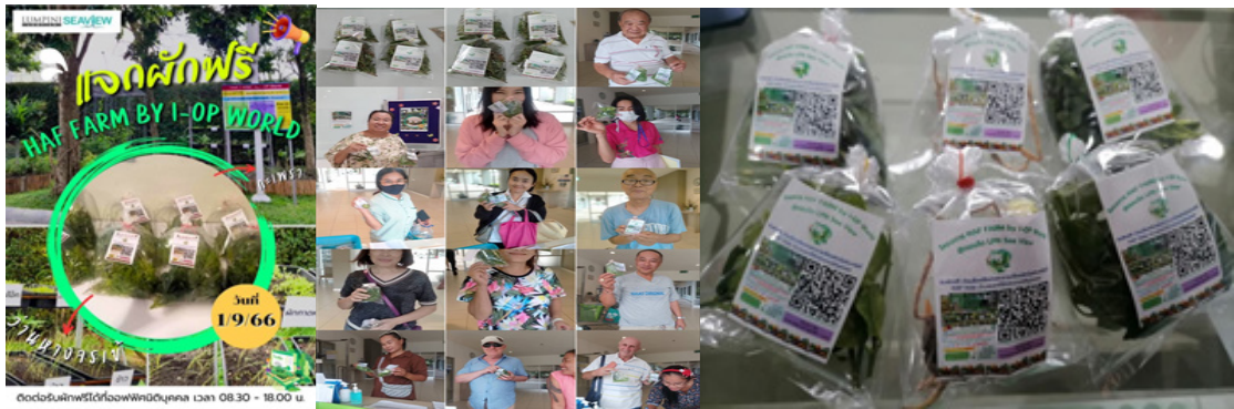
Figure 8. Activity in giving free vegetables for community members