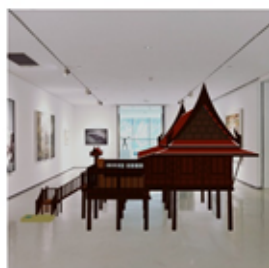
Thai House 1

The picture shows the installation of Beacon at