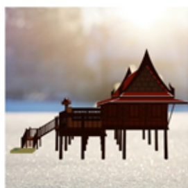
Thai House 3