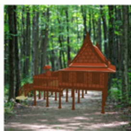
Thai House 6