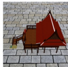
Thai House 5