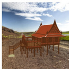
Thai House 8