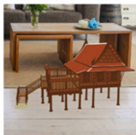
Thai House 7