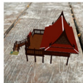
Thai House 4