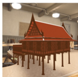
Thai House 10