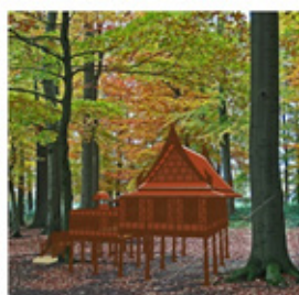
Thai House 9